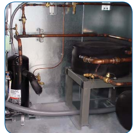
WSHP scroll compressor and coaxial heat exchanger integrated inside the air handler.