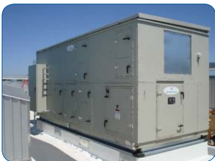
Venmar CES integrated WSHP air handler with energy recovery serving the Jaqua Center Auditorium.

To assure efficient heat recovery and complete building air treatment, the