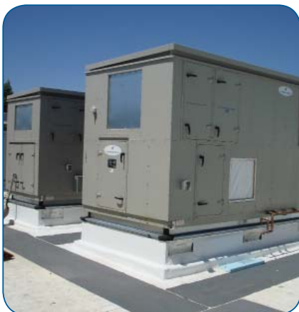
Two Venmar CES energy recovery rooftop air handlers provide neutral ventilation air to building.

According to Koller, the designers had initially considered utilizing air from the cavity of the dual-skin building façade for the purpose of pre-heating the ventilation air. This was eventually ruled out because the thermal buffering effect of the air within the cavity was shown to be more valuable than using it for pre-heating. "Additionally, each of the [Venmar CES] units already had air-to-air heat recovery, which further reduced the attractiveness of trying to use the cavity air for ventilation."