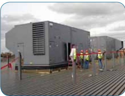
14 units were placed on the rooftop or interior mechanical rooms of the Battle Creek Central High School.