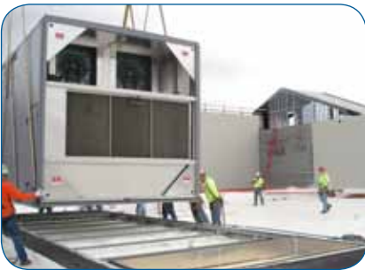
Installation of EnergyPack® fan and coil section on the insulated roof curbs provided by Venmar CES.

The loop water is piped to 14 custom air handlers. Most of these units are located on the building rooftop,