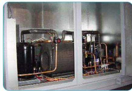
Ground-coupled heat pump comes factory packaged inside ventilator minimizing start-up time.