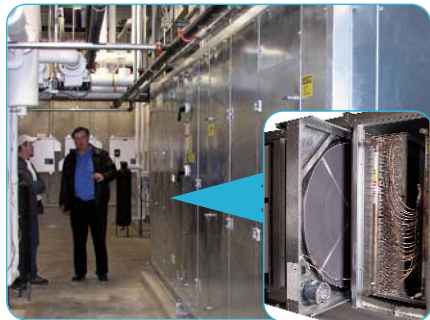
Dedicated outdoor air ventilator uses an AHRI Certified™ total-energy wheel to recover energy between the exhaust and outdoor airstreams.

Building HVAC designers have long understood both the benefits and shortcomings of central-plant heating and cooling using forced air. Development of the VAV approach in the last half of the 20 th century allowed improved efficiency through better zone control and variable rates of ventilation, but some of the limitations of forced air combined heating and cooling remain. Air is an inefficient energy transport medium, and a significant portion of a building's energy expense goes to the fan motors needed for air distribution. Large-volume recirculation of building air, as in the typical VAV system, can lead to distribution of contaminants throughout the building.