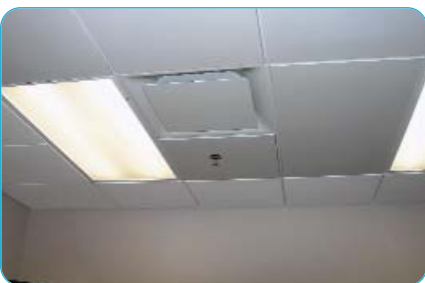
Ceiling mounted radiant panels provide sensible heating and cooling to the occupants. Conditioned outdoor air is delivered directly to the space to remove latent loads.